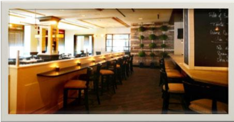
Lounge & Main Dining Room