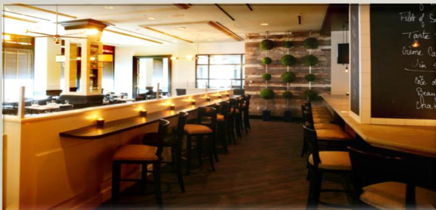
Lounge & Main Dining Room